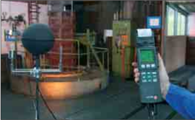
Measure with testo 400 and WBGT probe