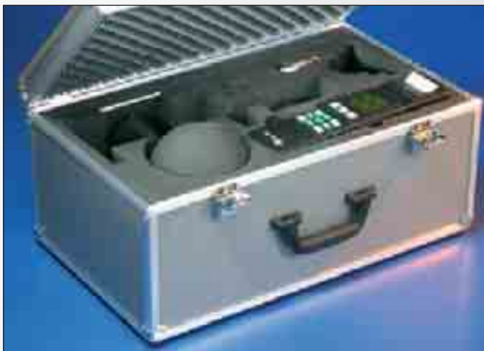
The WBGT case for fast assessment of workplaces

The testo 400 measuring instrument calculates indices and shows them in its display.