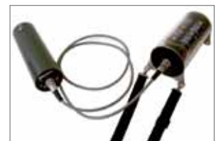
EDm motor drive